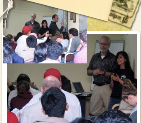
FHI Peru Staff Development Training