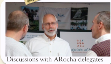
Discussions with AROCHA delegates

We understand how to better impact our culture as we understand what each culture believes at its heart. The Great Commission in one sense is a command to narrow the gap between what our culture believes and what God demands.